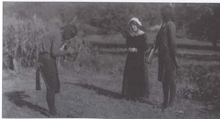
FIGURE 8. Anachronism.