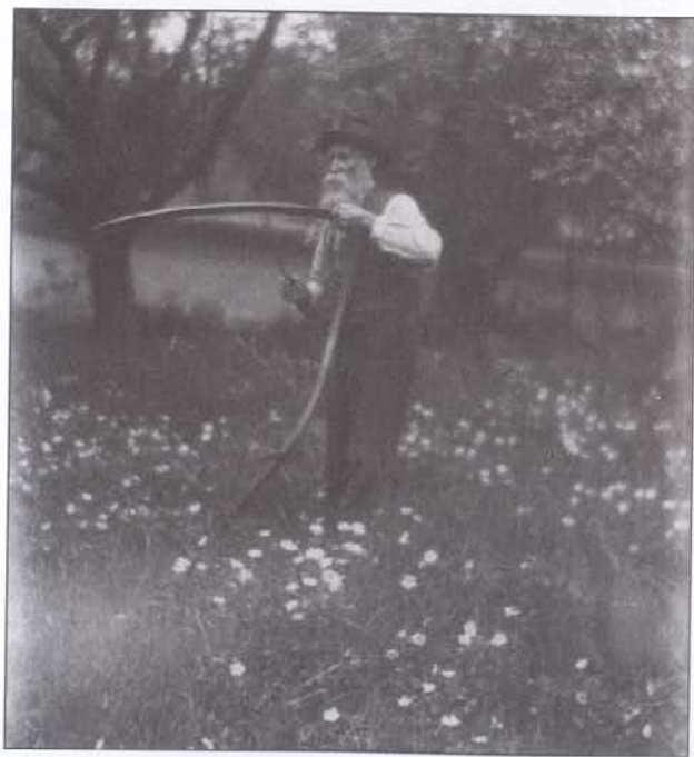
FIGURE 4. Sharpening the Scythe