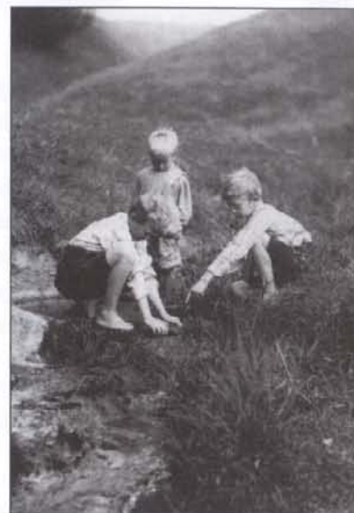
FIGURE 12. Making a Dam.