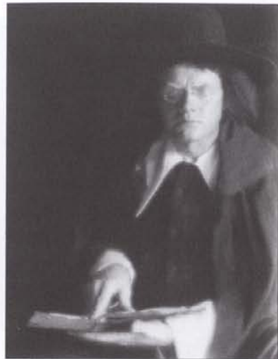
FIGURE 6. The Letter of the Law