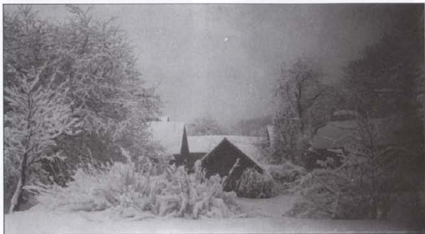
FIGURE 9. Snowstorm.