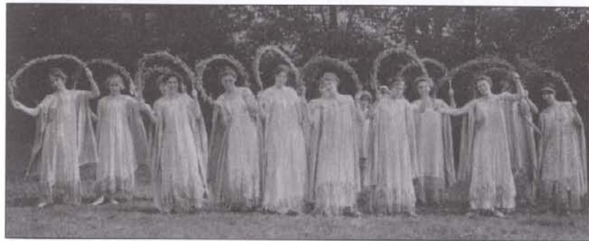
FIGURE 7. Spirit of the Wheat.