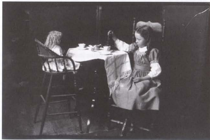
FIGURE 13. Little Girl & Doll at a Tea Party.