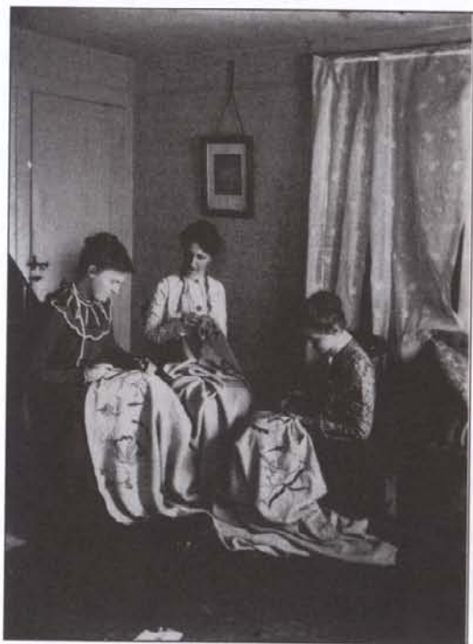
FIGURE 2. Deerfield Society of Blue and White Needlework.