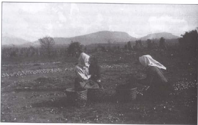
FIGURE 3. Onion Harvest.