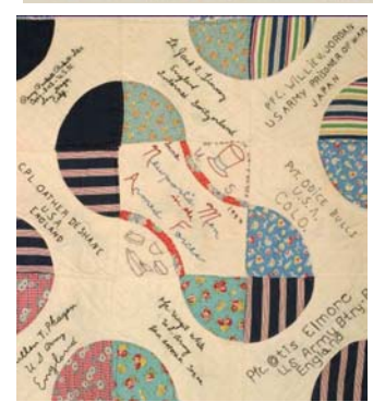
17.Roll Call quilt. Maker unknown, June 1944, Newport, TX. 66 ½" x 86" cotton, pieced. New England Quilt Museum.