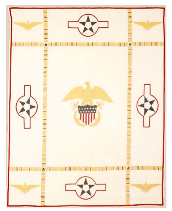
21. Sea Wings to Glory. Maker unknown, 1943, Mountain Mist Company. 71 ½" x 87" cotton, appliqué.