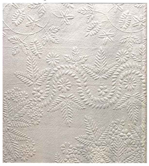
8. Barbara Lotspeich Broyles, ca. 1840, Rhea County, Tennessee. 81" x 77" cotton, quilted and stuffed. Collection of Bettye Broyles.