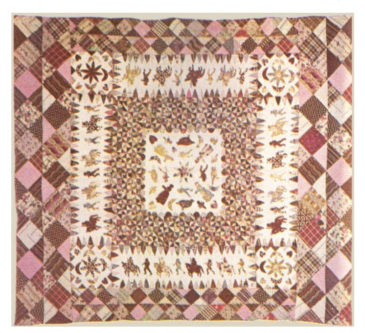
19. Civil War Counterpane. Made by a wounded Union Soldier during convalescence, 3<sup>rd</sup> quarter 19<sup>th</sup> century, New Jersey. 96" x 111" cotton, pieced and appliquéd. Shelburne Museum, Shelburne, VT.