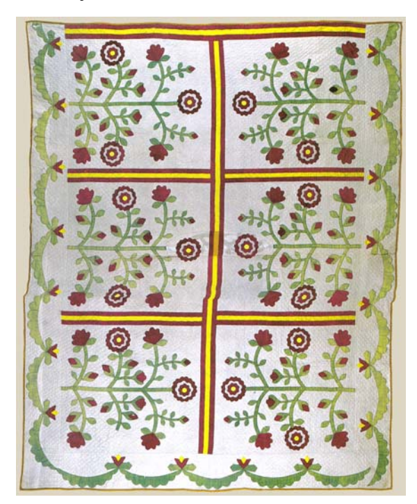
6. Rose Tree. Maker unknown, n.d., possibly Tennessee. 92" x 72" cotton, appliqué. Collection of Ella Ree Bounds.